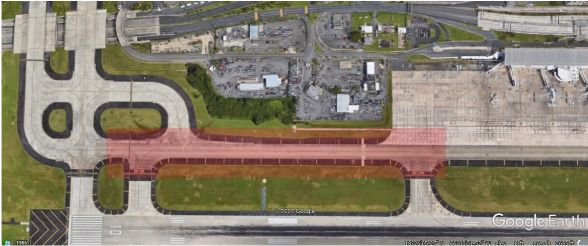
FIGURE 1. SJU AIRPORT – TAXIWAY H LOCATION

Scope of the work - Phase 2: Phase 2 consists of the pavement rehabilitation of Runway 8-26, the primary departure runway at the Airport due to its length, 10,400 feet.