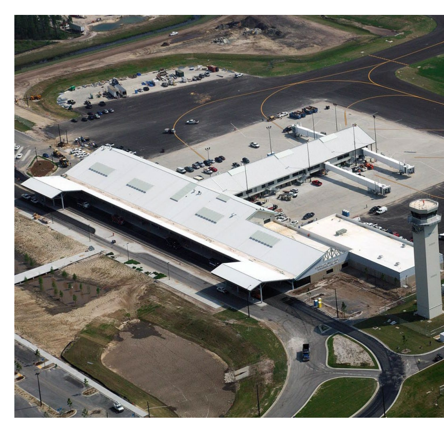
Wayne County Airport Authority North Terminal Redevelopment Romulus, MI