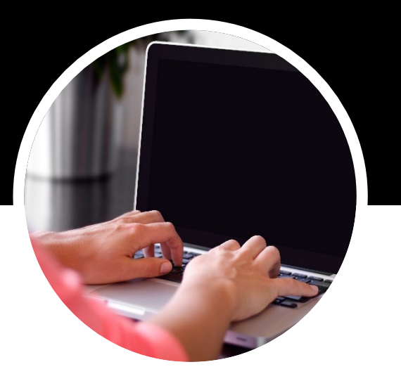
Business / organization configurations aren't often responding quickly enough