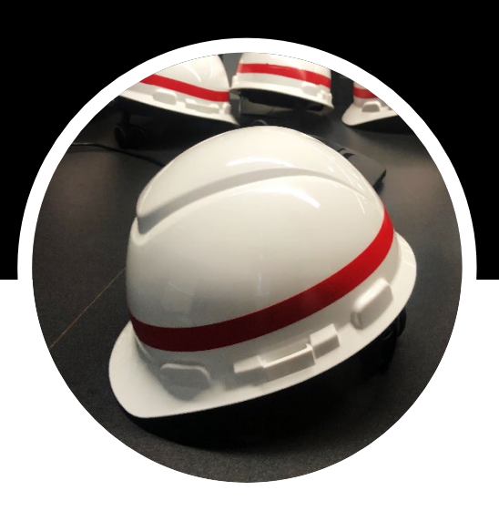
Example – Safety; Initiation of the 'red stripe' program for apprentices