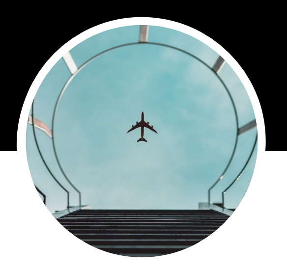
ACI ACC AGC's Project Delivery Guide for Airports