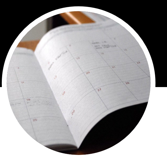
May affect project schedules, location dependent (mitigate through trade-power commitment during bidding)