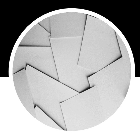
CII's PDRI – Project Definition Rating Index