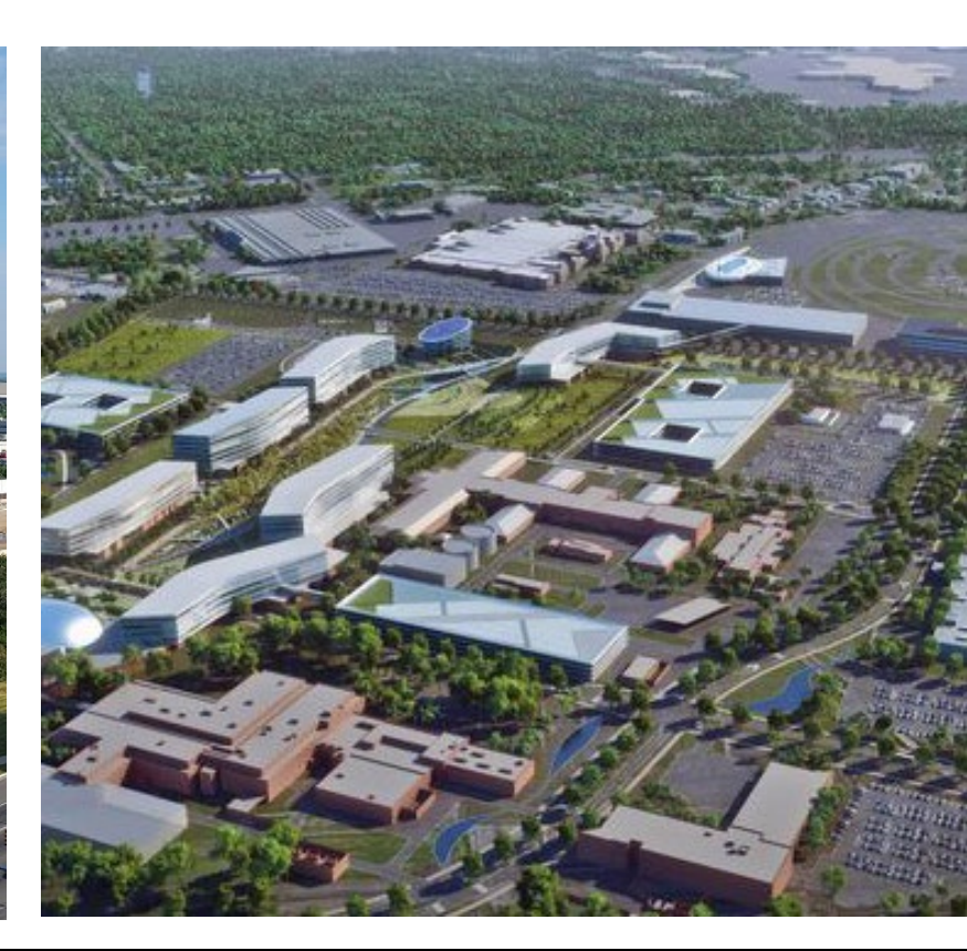
Fiat Chrysler Automobiles LLC Assembly Plant & Supplier Buildings Recife, Brazil