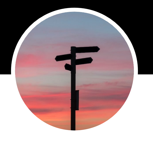
Retiring of Baby Boomers & Experience gap due to Great Recession downturn