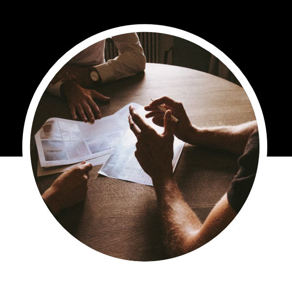
Understand the project: Available trade-power & project delivery experience of your team