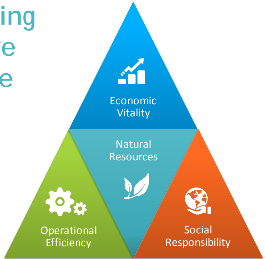
ACI-NA's EONS Framework