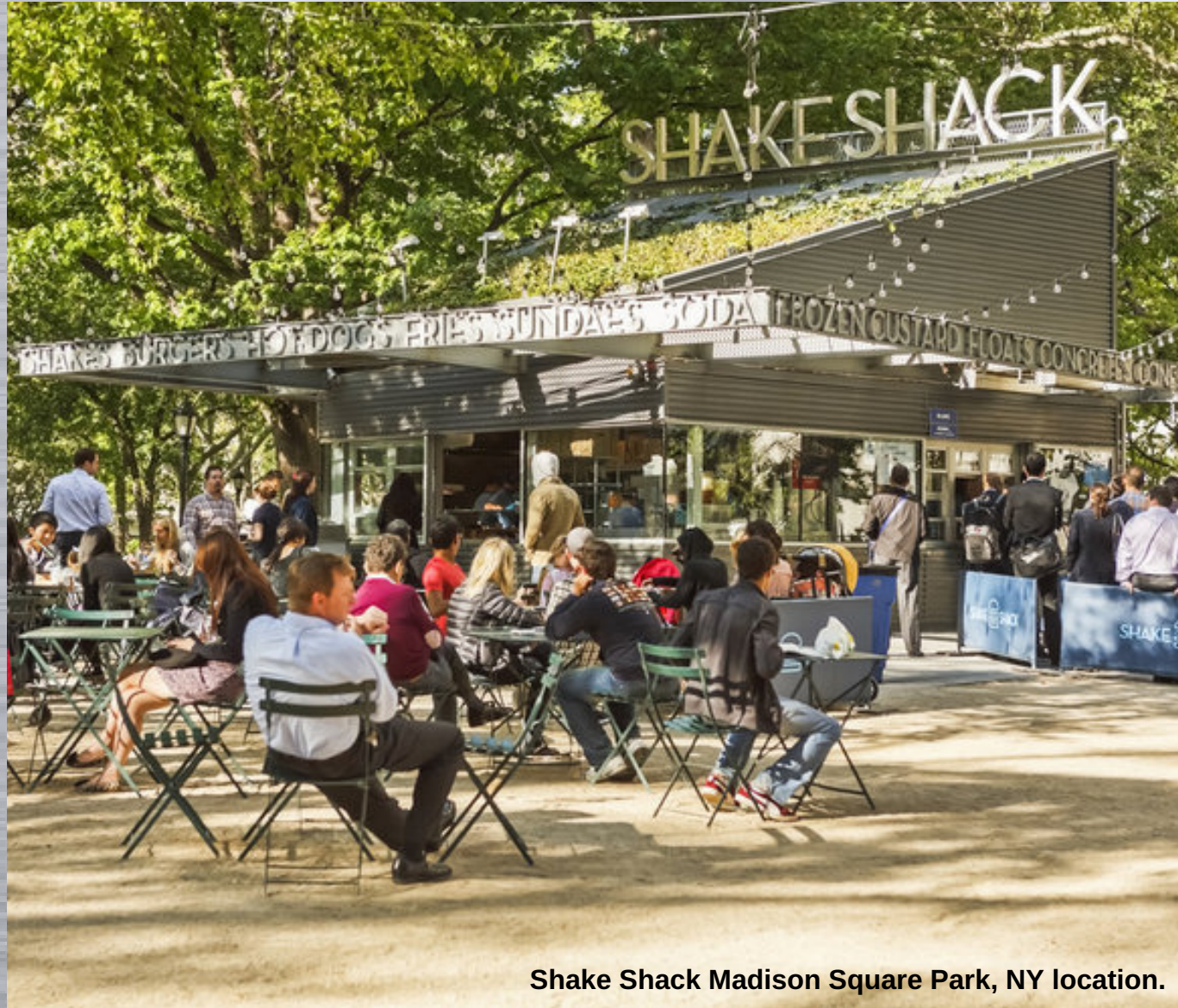
Shake Shack Madison Square Park, NY location.

A fun and lively community gathering place with widespread appeal, Shake Shack has earned a cult-like following around the world. Now, HMSHost brings this same iconic experience of a modern day “roadside” burger stand to airport travelers at LAX Terminal 3.