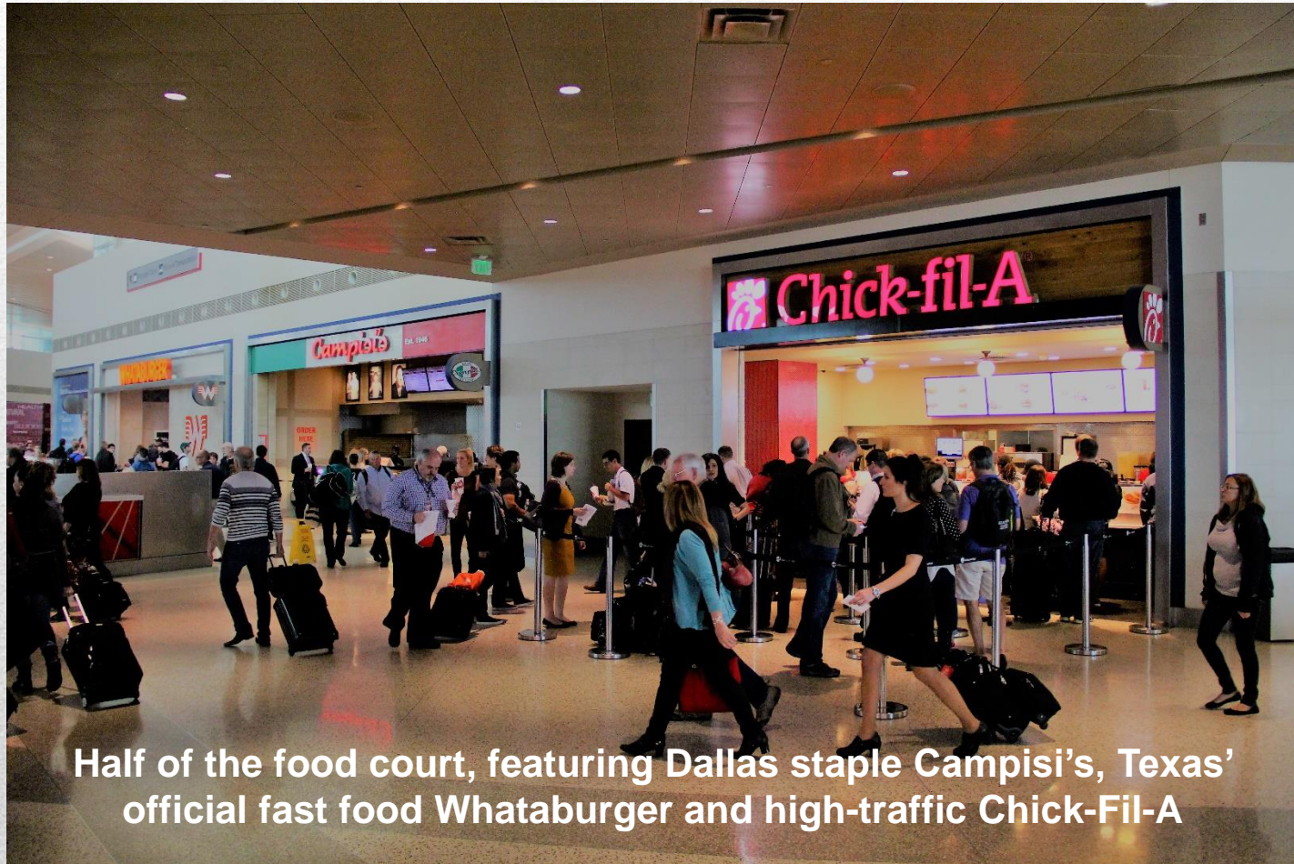
Half of the food court, featuring Dallas staple Campisi's, Texas' official fast food Whataburger and high-traffic Chick-Fil-A