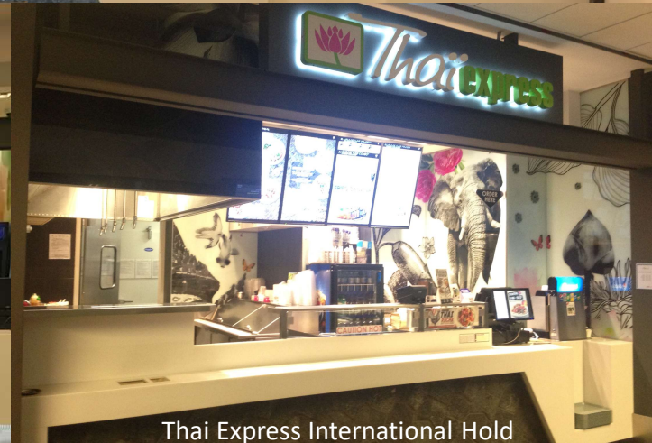
Thai Express International Hold