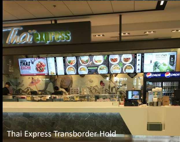
Thai Express Transborder Hold