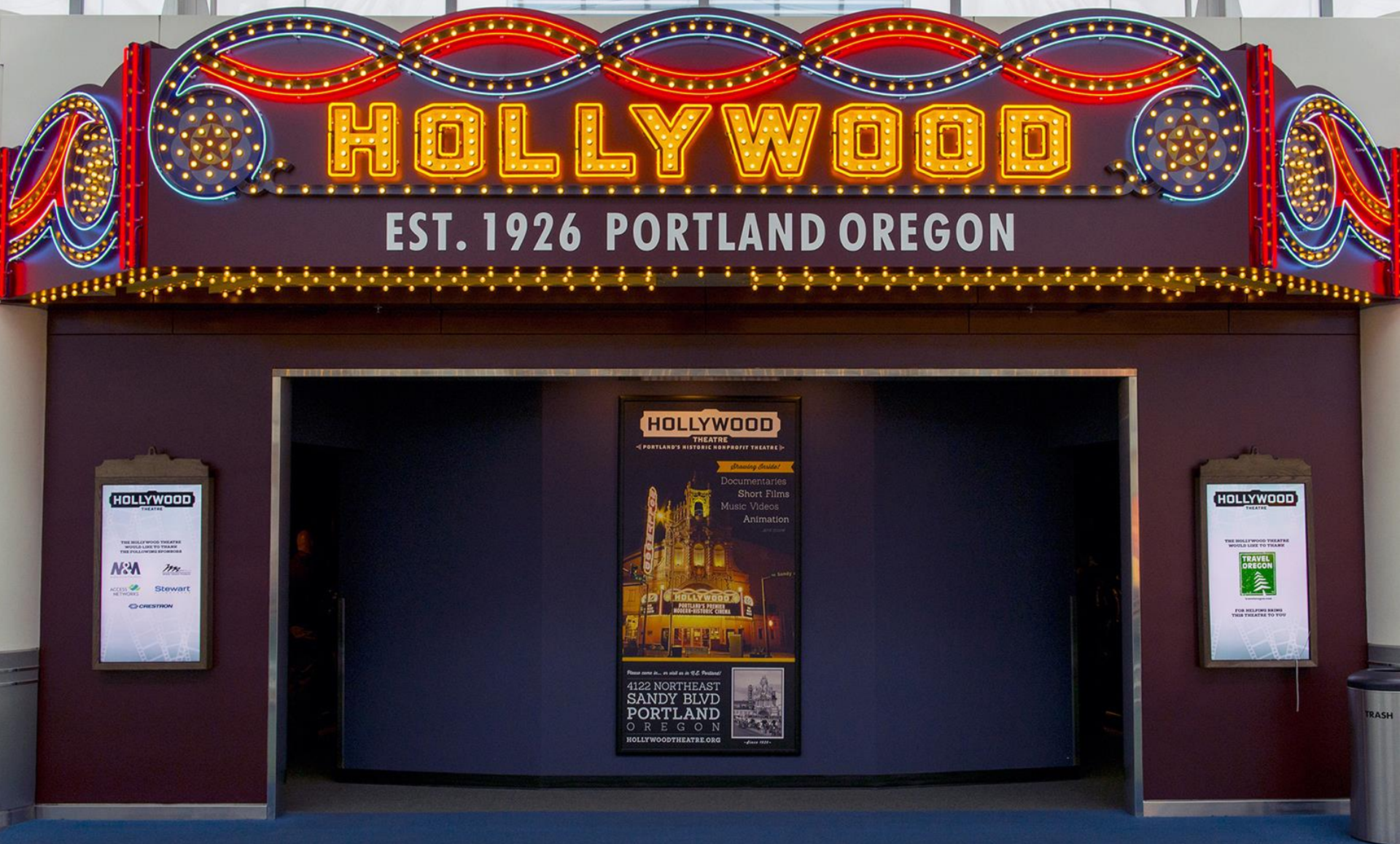
Best Innovative Consumer Experience Concept Hollywood Theatre – Portland International Airport